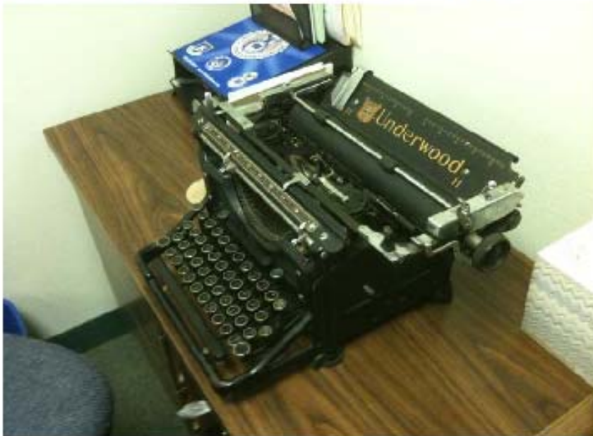
1930s Underwood Manual Typewriter

Pictured below is a closeup of the new equipment. Mr. Lavin indicates he is particularly proud of the fact it is immune to power failures and hard drive crashes.